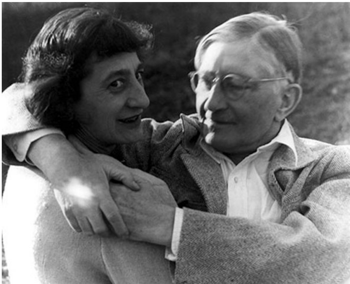
Josef and Anni Albers at Black Mountain College in 1949.

On October 28, MUDEC, Milan's new ethnographic museum, will launch the exhibition "A Beautiful Confluence: Anni and Josef Albers and the Latin American World," which will reveal a lesser-known facet of the legendary Modernist couple Josef and Anni Albers : their deep interest in Latin American cultures.